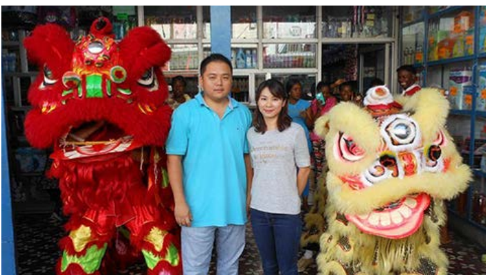
Downtown merchants welcome the Lion Dance for Chinese New Year 2019.