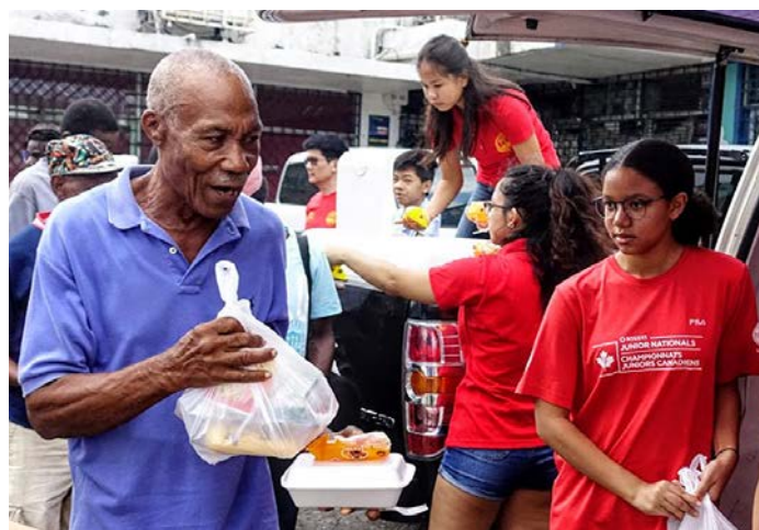
A grateful recipient of lunch and a care package expresses his gratitude at Silver Slipper Plaza as CBA youngsters participate in the Street People Feeding Programme in February 2019.