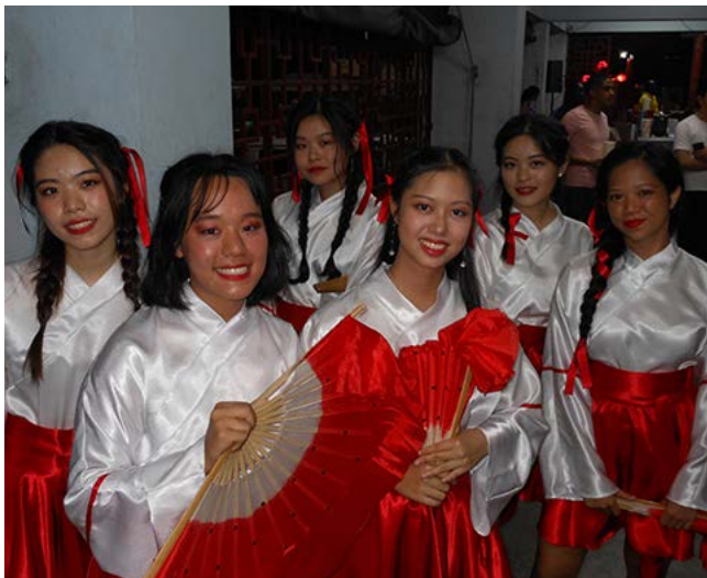
Beautiful Fan Dancers in their beautiful costumes.