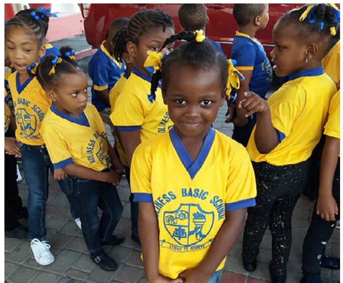
A young student of Holiness Basic School smiles for the camera after her school's tour of the Museum.