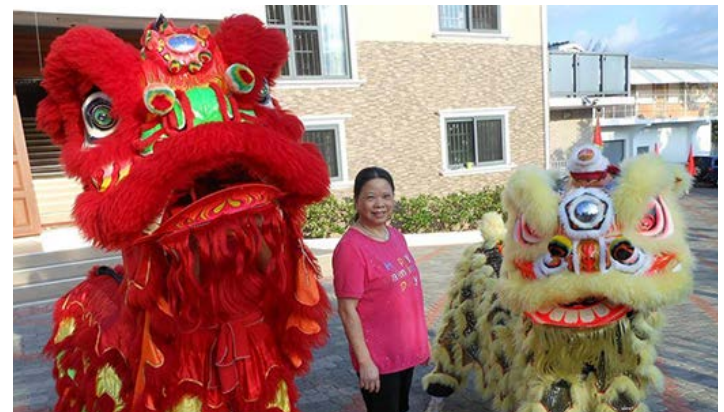
The Lions bring good luck to a private residence in St. Andrew.