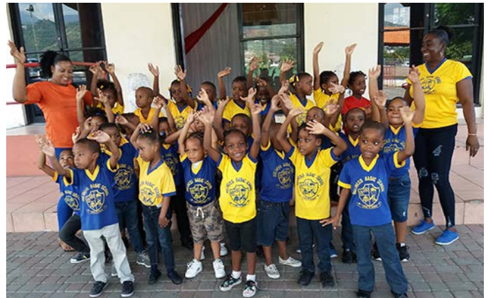
Students from the Holiness Basic School enjoy their tour of the Jamaica Chinese Historical Museum at the CBA Centre.

We can tell that when these young children grow up, their visit to the CBA will have pride of place in their minds for years to come.