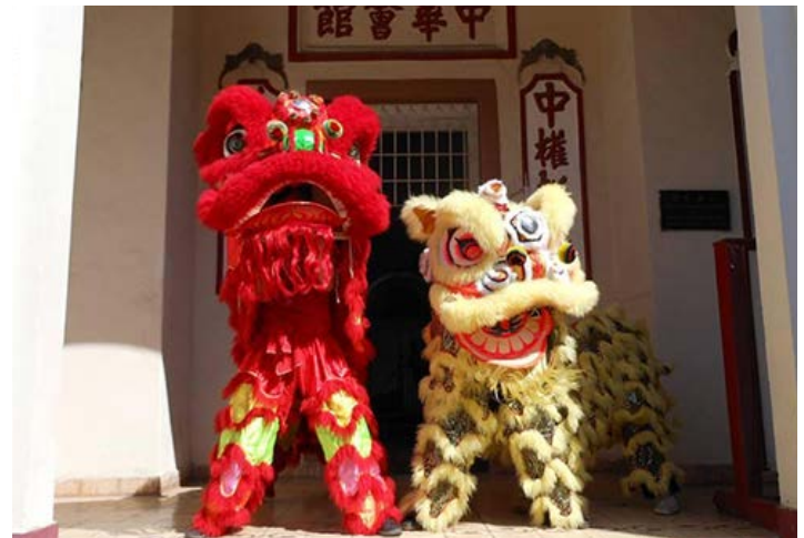
The Lion Dance honours the Chinese Temple on Barry Street in downtown Kingston.