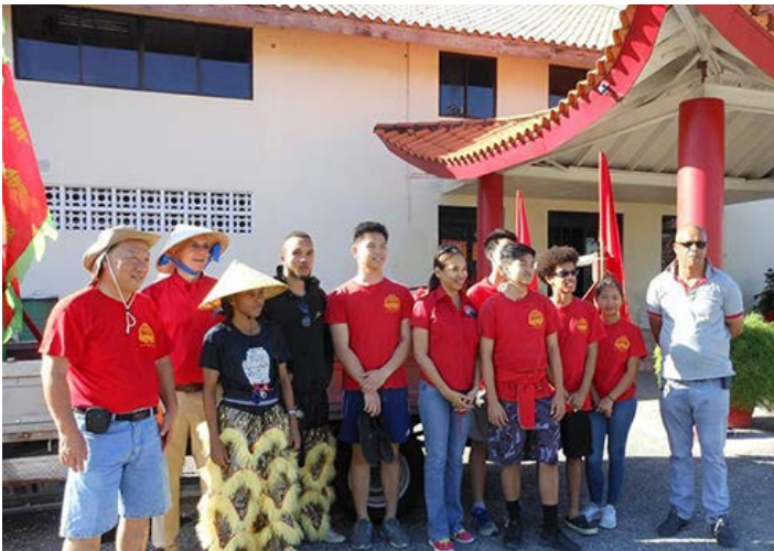
The CBA Lion Dance team gets ready to head out and perform in downtown and uptown Kingston.

Here are some images which capture the festivity!