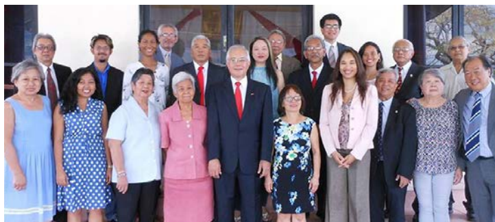
Elected Officers - Board of Management 2019