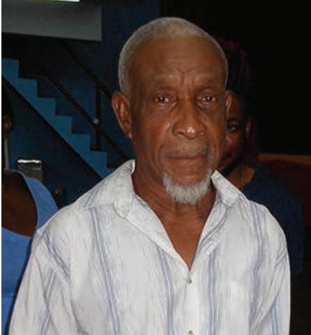
The man of the moment.