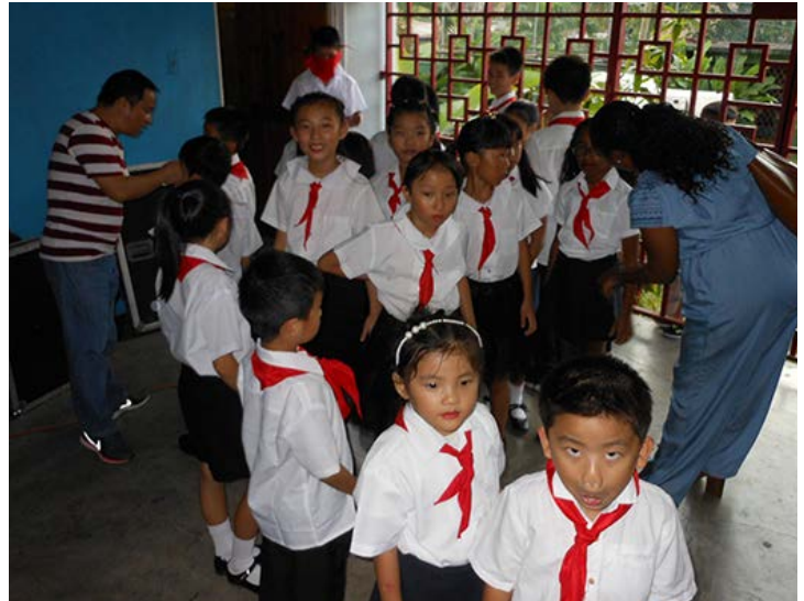
Mandarin Class children get ready to take the stage.